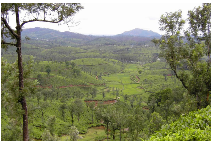
5. The Nilgiri hills are an important tea growing area.