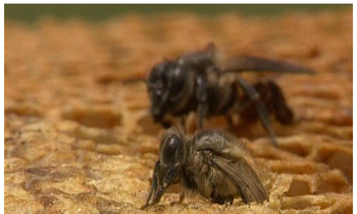
3.5. Adult Giant honey bees ( Apis dorsata ) emerge from their cells in the broodcomb