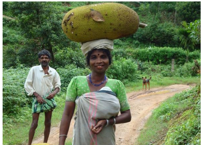
2.4. Adivasi couple collecting jackfruits from the forest