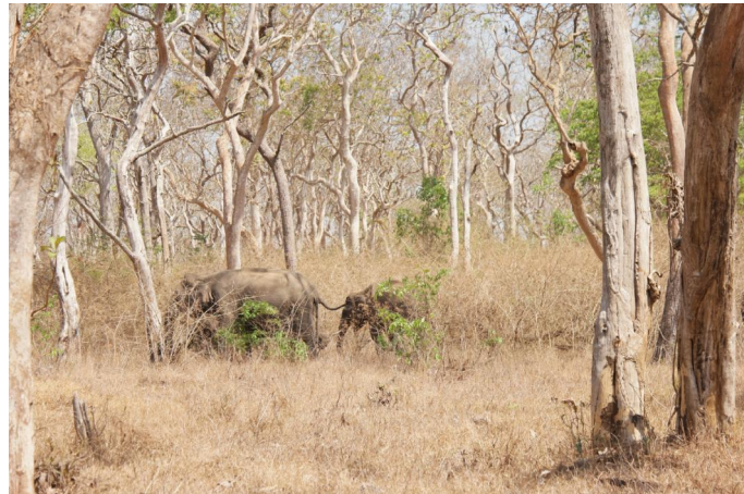
8. The Nilgiri hills are home to 5,200 elephants.