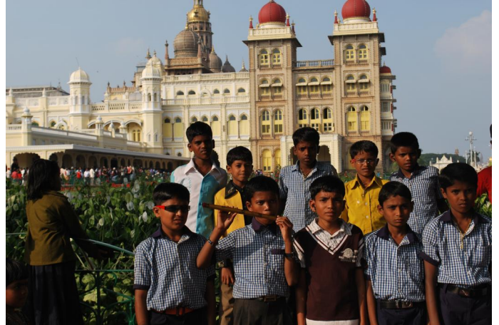
2. You travel further South to Mysore (900,000 inhabitants).