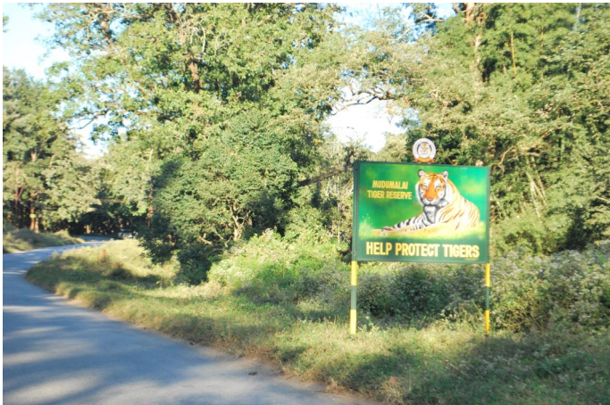
7. The remaining forests are protected for the huge wildlife.