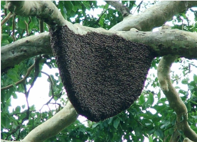
3.1. Comb of the Giant honey bee ( Apis dorsata ) attached to a tree in the South Indian Nilgiri mountains