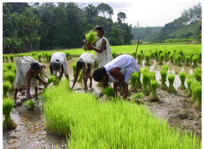
2.6. Adivasi women transplanting rice plants