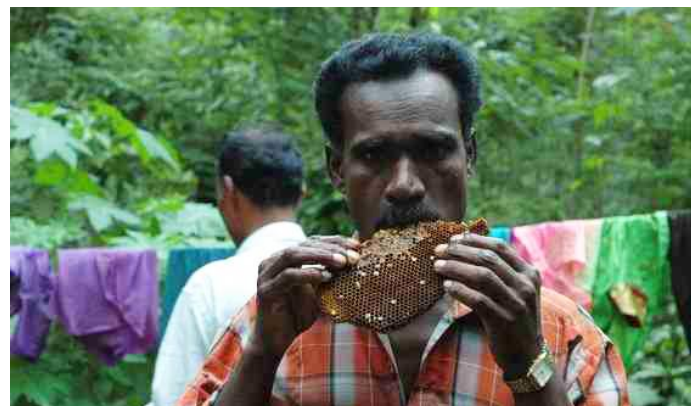
3.7. An adivasi man with a honeycomb