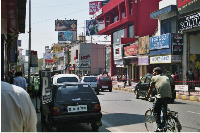
1. You travel to the city of Bangalore (8.5 mill. inhabitants).