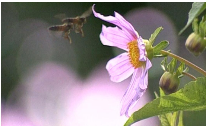
3.3. Giant honey bee ( Apis dorsata ) pollinate a flower