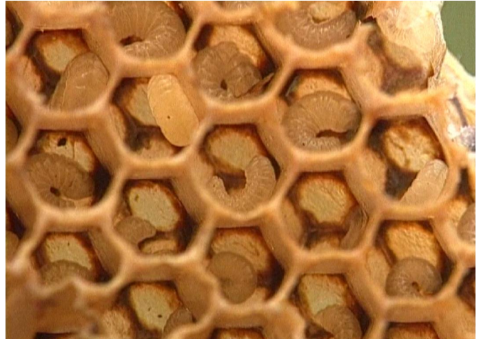
3.4. Larvae of the Giant honey bee ( Apis dorsata ) breed within their cells of the broodcomb