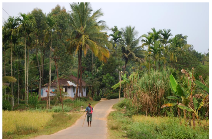
6. In the valleys and villages people sustain themselves through agriculture.