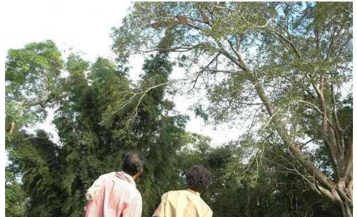
3.6. Adivasi men spot honeycombs on a tree