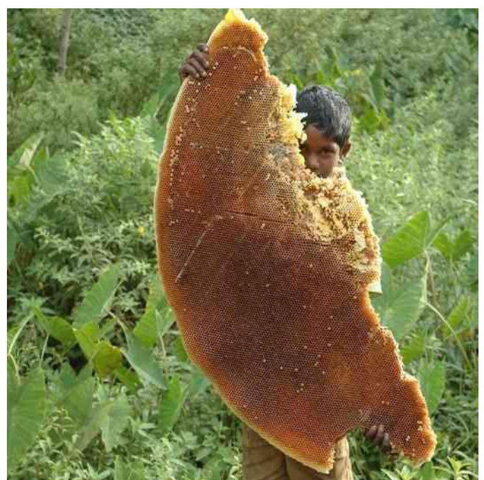
3.8. An adivasi boy with a honeycomb