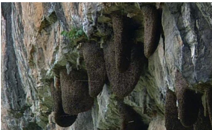
3.2. Combs of the Giant honey bee ( Apis dorsata ) attached to cliffs in the South Indian Nilgiri mountains