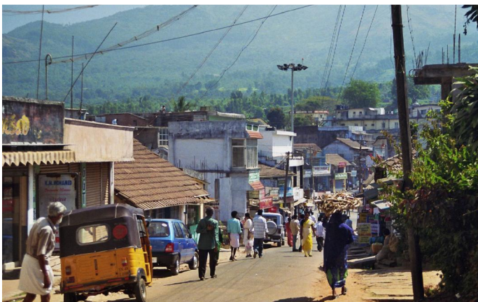
3. You reach Gudalur in the Nilgiris (50,000 inhabitants).