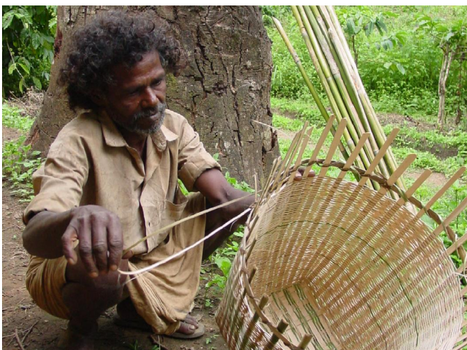
2.5. Adivasi man making a bamboo basket