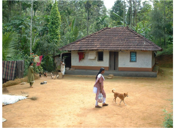
2.2. Adivasi house made of bamboo, loam and tiles