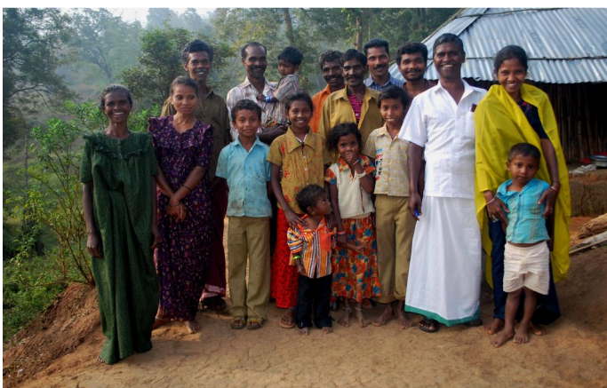
9. Adivasis (indigenous people) are native to the Nilgiris.