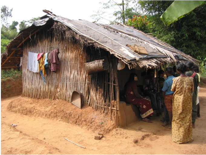
2.1. Adivasi house made of bamboo, loam, grass, frond