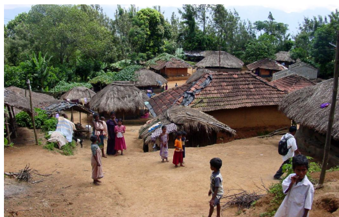
10. Many aspects of their life are linked to the forest.