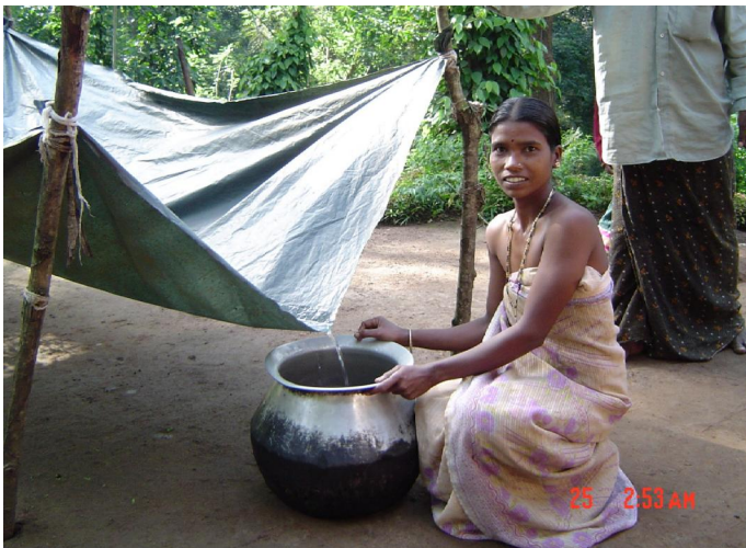
2.3. Adivasi woman collecting rain water