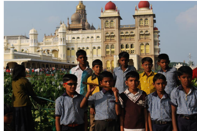
2. You travel further South to Mysore (900,000 inhabitants).