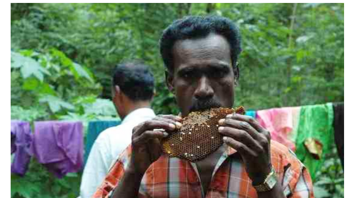
3.7. An adivasi man with a honeycomb