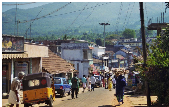
3. You reach Gudalur in the Nilgiris (50,000 inhabitants).