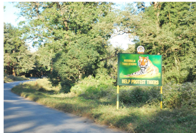
7. The remaining forests are protected for the huge wildlife.