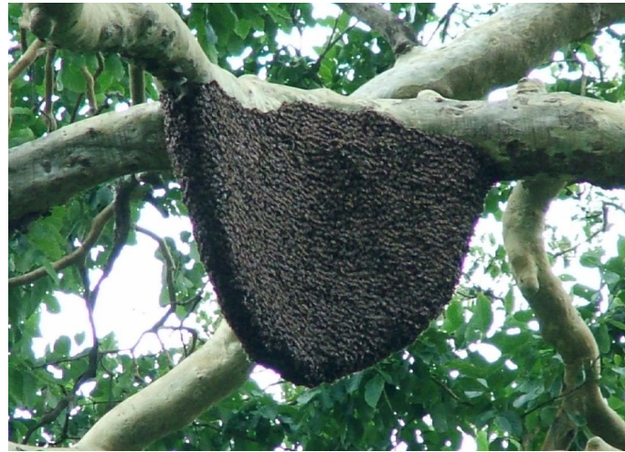
3.1. Comb of the Giant honey bee ( Apis dorsata ) attached to a tree in the South Indian Nilgiri mountains