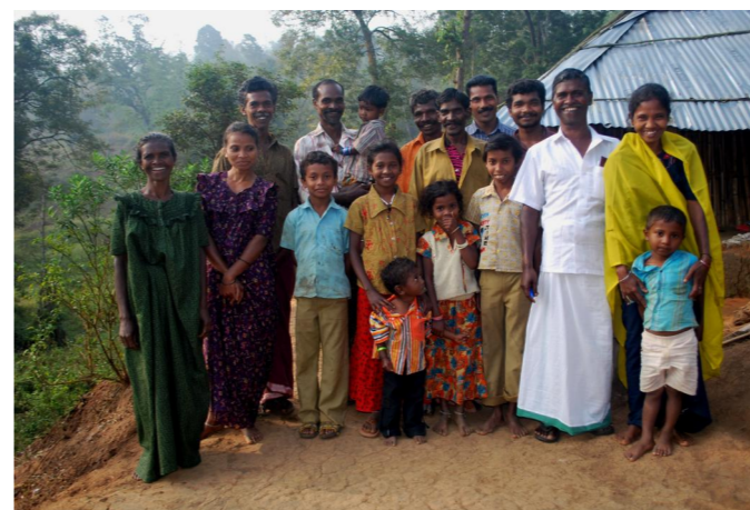
9. Adivasis (indigenous people) are native to the Nilgiris.