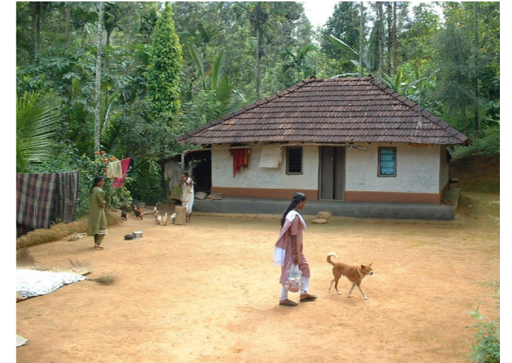
2.2. Adivasi house made of bamboo, loam and tiles