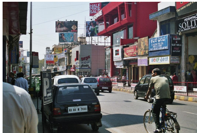
1. You travel to the city of Bangalore (8.5 mill. inhabitants).