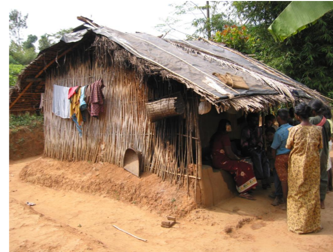
2.1. Adivasi house made of bamboo, loam, grass, frond