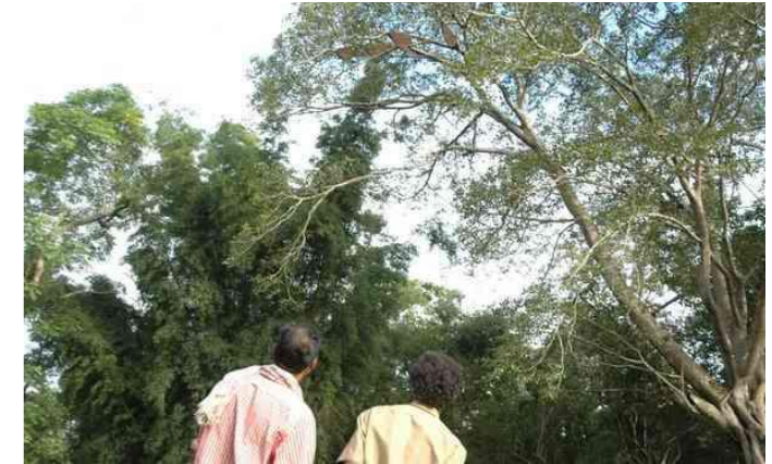
3.6. Adivasi men spot honeycombs on a tree