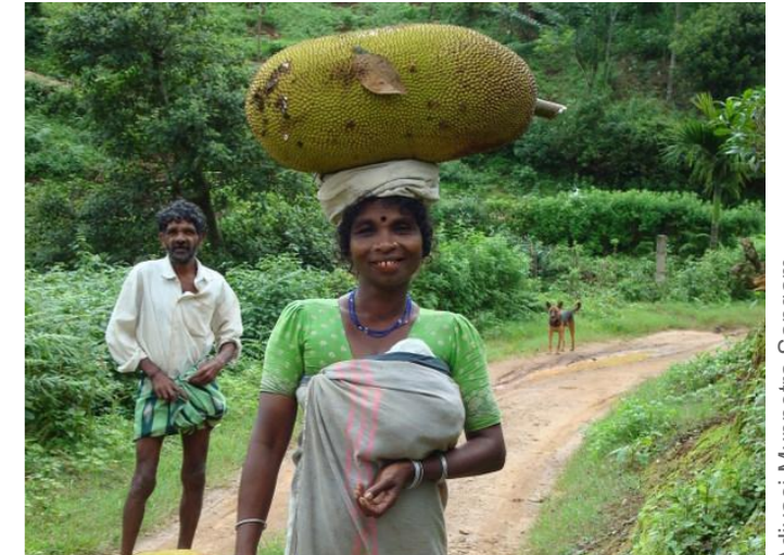
2.4. Adivasi couple collecting jackfruits from the forest