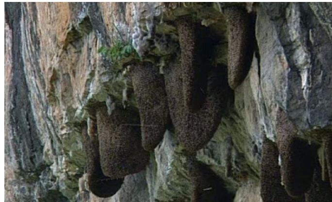
3.2. Combs of the Giant honey bee ( Apis dorsata ) attached to cliffs in the South Indian Nilgiri mountains