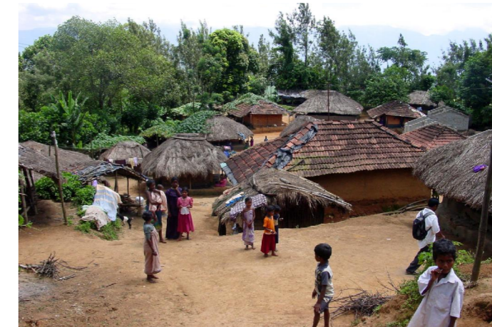
10. Many aspects of their life are linked to the forest.