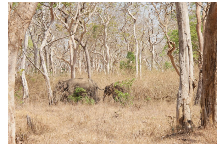
8. The Nilgiri hills are home to 5,200 elephants.