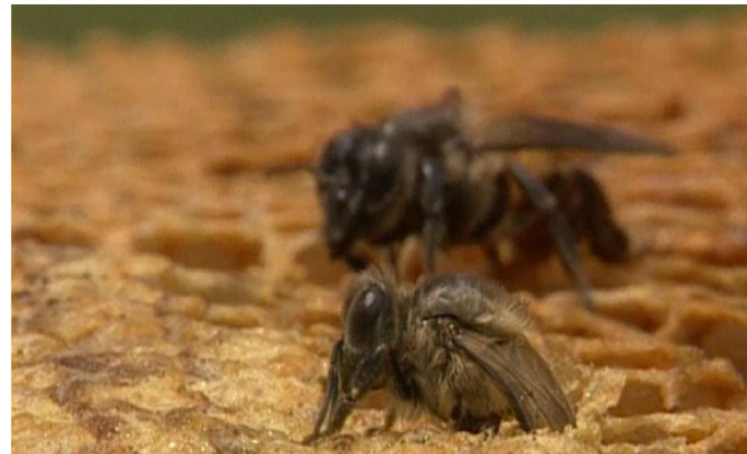
3.5. Adult Giant honey bees ( Apis dorsata ) emerge from their cells in the broodcomb