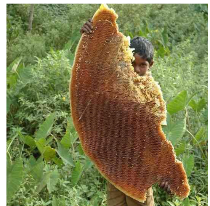
3.8. An adivasi boy with a honeycomb