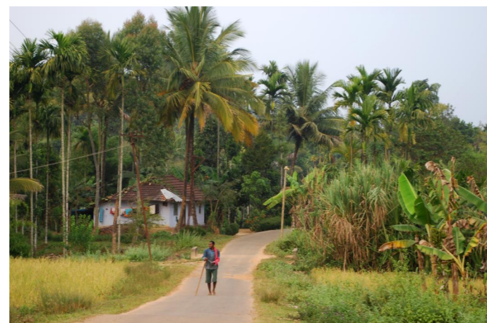
6. In the valleys and villages people sustain themselves through agriculture.