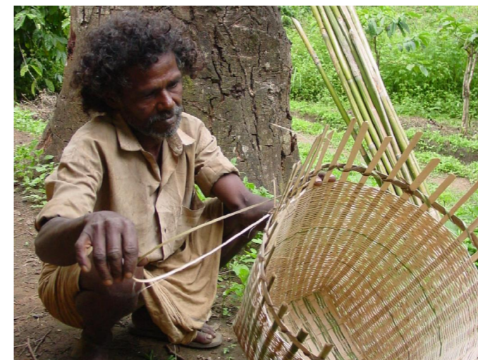
2.5. Adivasi man making a bamboo basket