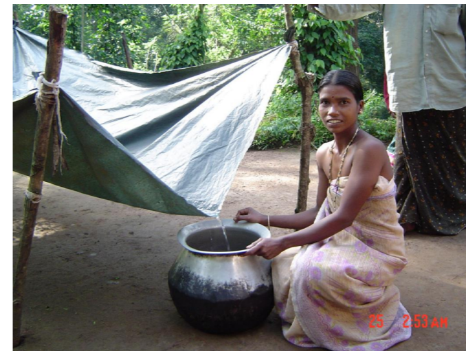
2.3. Adivasi woman collecting rain water