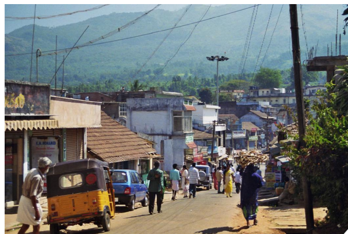
1.1: The town Gudalur in South India