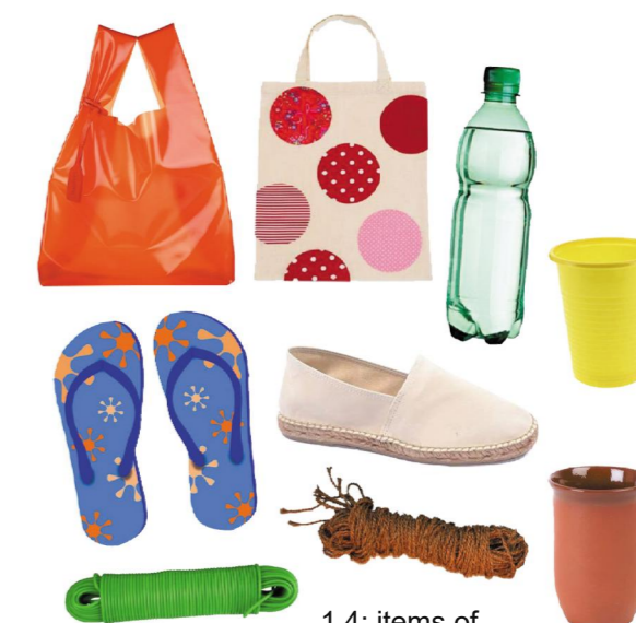
1.4: items of different materials