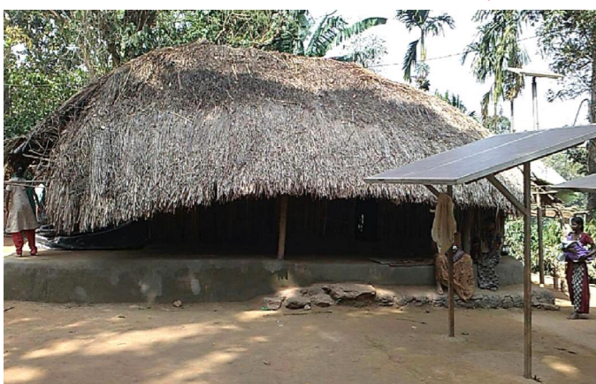
2.3: A traditional adivasi house with solar panels in front